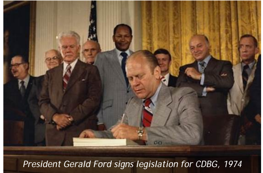
President Gerald Ford signs legislation for CDBG, 1974